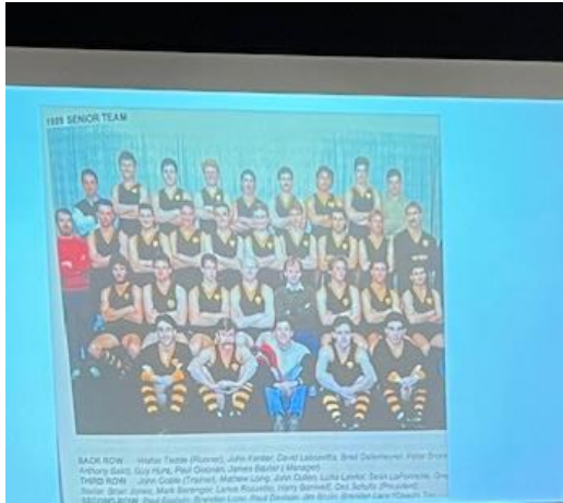
The YCW Team of a few years ago